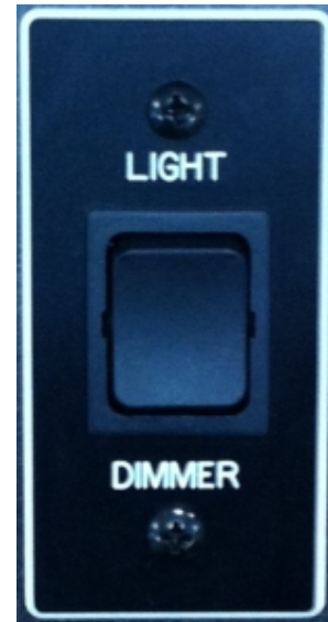
Potential Customer Install